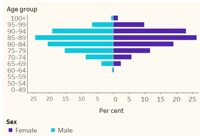
Figure 1: Admissions into permanent residential care, by age group and sex, 2022–23

Although the majority of aged care admissions are for older people, admissions for younger people also occur. In 2022–23, around 2,000 admissions to aged care services were for people aged under 65 (representing less than 1% of total admissions). More women than men are entering aged care; 3 in 5 (60%) admissions to aged care services were for women. Higher proportions of women entered permanent residential aged care at an older age compared with men (Figure 1).